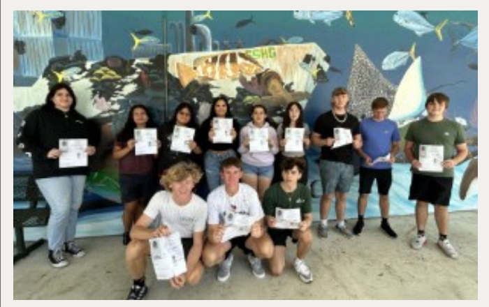
Pictured Above: CSHS Culinary Students

Coral Shores students have been busy this month earning Industry Certifications. Twenty-six automotive students earned 84 ASE certifications covering 11 categories of auto mechanics. This is the first year four female students have earned certifications and a record high twelve students earned the MLR-Maintenance Light Repair-certification. Twenty-six culinary students passed the National Registry of Food Safety Professionals and twenty-four of them received their ServSafe certification. Congratulations to them all!